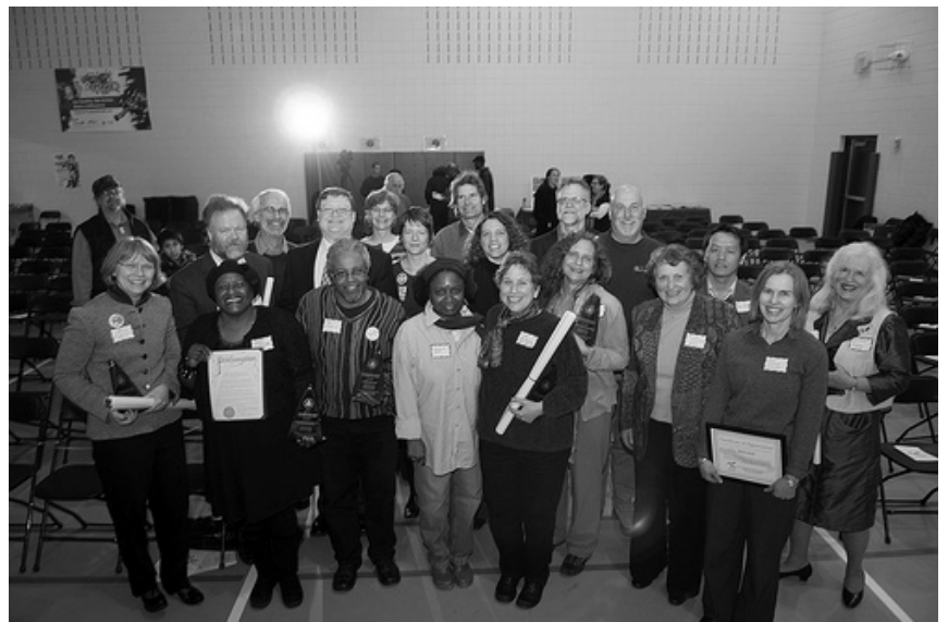
Pictures from top left: EPA Award statue, Cover of Stops For Us: Organizing for equity in Central Corridor Booklet, Award Recipients at celebration event.